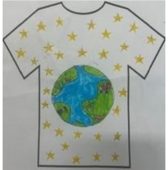
Travel ambassador t-shirt design winner Ayo Y3